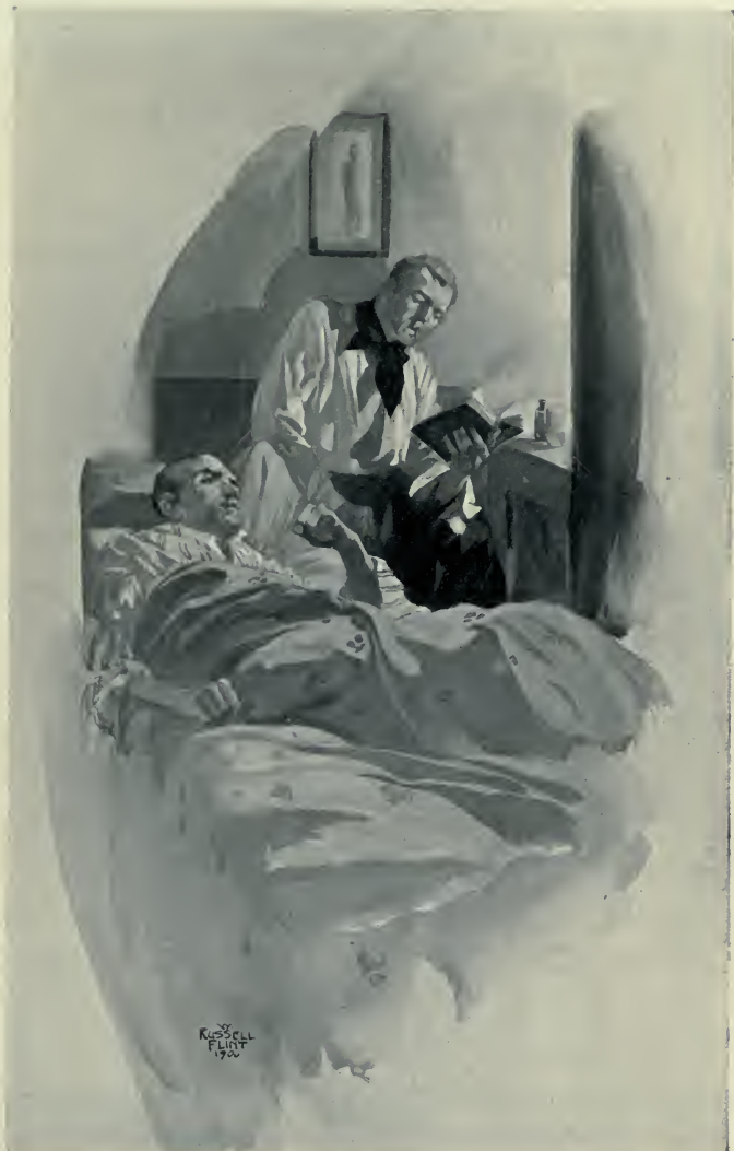
“THE DYING GLADIATOR LISTENED WITH INTENT INTEREST.”